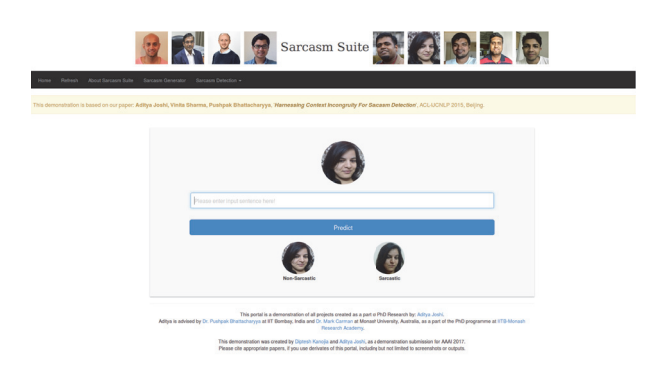
Figure 2: Snapshot of Sarcasm Suite